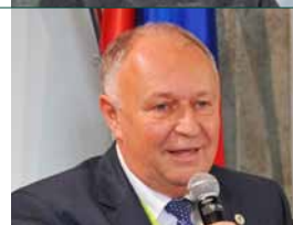
Mr Alexey Plakhotnikov, Mayor of the City of Kotovsk, Russia