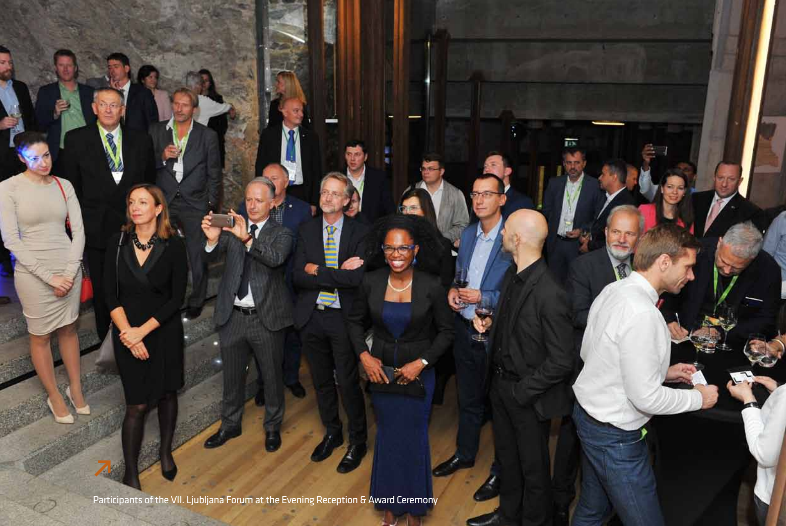
Participants of the VII. Ljubljana Forum at the Evening Reception & Award Ceremony

The project Wcycle is the strategic developmental model of the City of Maribor as an urban center in the field of integrated management of all generated waste, surplus energy, and wastewater based on the policy of circular economy as material, energy, and water strategy of using processed waste, energy, and treated water as new sources. IWM is a long-term project, providing development-oriented management of flows of resources in the local and regional area and operates mainly on research and development level. The purpose is based on cross sector resource recovery, which will be done through the urban metabolism approach addressing a circular economy in selected sectors. Expected consequences of these activities will be the emergence of new business opportunities for MOM, citizens and industry creating of high-quality, predominantly green jobs, new added value, and new economic momentum. The project embodies innovative system, which to date does not exist anywhere else and is complemented by collaborative economy principles.