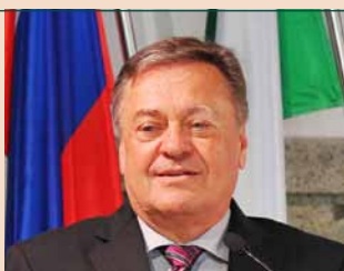
Mr Zoran Janković, Mayor of the City of Ljubljana, Slovenia