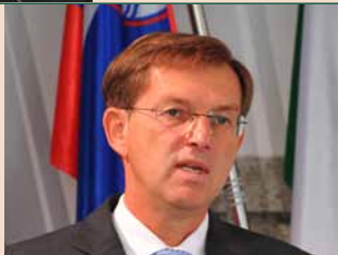
Mr Miro Cerar, Prime Minister of the Republic of Slovenia, Slovenia