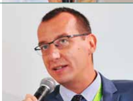
Mr Marko Filipović, Deputy Mayor of the City of Rijeka, Croatia