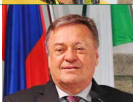
Mr Zoran Jankovič, Mayor of the City of Ljubljana, Slovenia