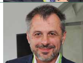
Mr Igor Radojičić, Mayor of the City of Banja Luka, Bosnia and Herzegovina