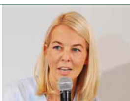
Ms Tjaša Ficko, Vice Mayor of the City of Ljubljana, Slovenia