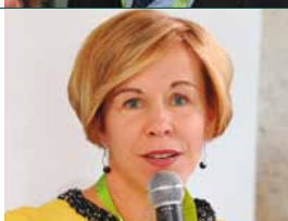
Ms Zsófia Hassay, Mayor of 6th district of the City of Budapest, Hungary