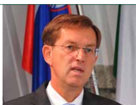
Mr Miro Cerar , Prime Minister of the Republic of Slovenia