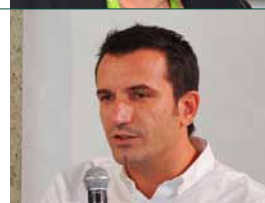
Mr Erion Veliaj, Mayor of Tirana, Albania